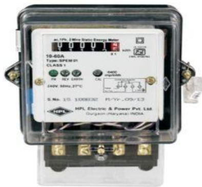
Figure: 1 Analog Energy Meter

The voltage and current produced by the potential transformer and current transformer in analogue energy meter respectively. With the aid of analogue to digital converters these analogue values are converted into digital samples (ADC). These samples were transformed by a frequency converter to frequency signals. It was used to monitor the counter device that combines these samples over time and reads the electricity usage. Comparing electromechanic energy meter, the analogue energy meter is more reliable but less accurate than the optical power meter.