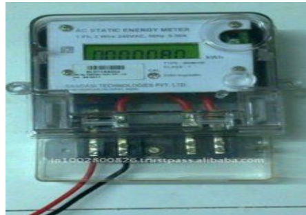
Figure: 2 Digital Energy Meter

meter costs in comparison with electromechanic and analogue energy meter. Installations are high. Digital power meter accuracy depends on the microprocessor.