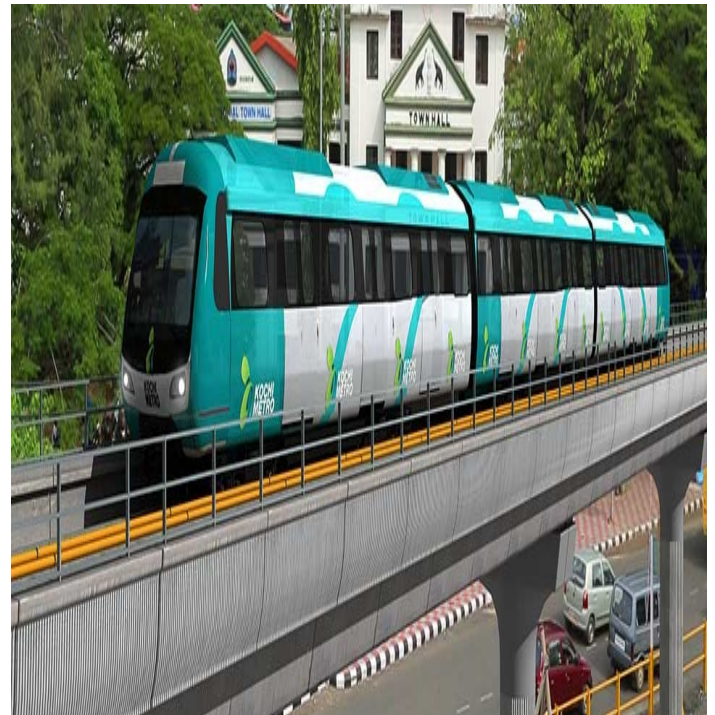
Fig 2. Kochi Metro in Kerala

successfully met with Alccofine 1203. Concrete elements with Alccofine will surely stand the test of time.